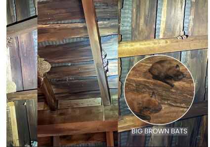
Existing roosting areas in the roof rafters and metal roof