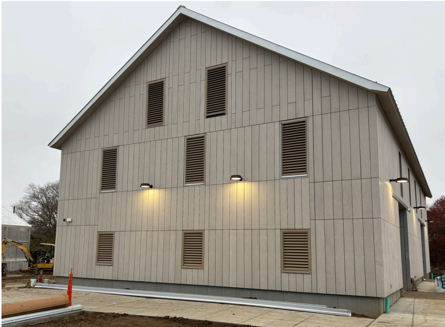
New exterior envelope over existing barn, louvers for bat habitat access and maintenance access for cleaning and monitoring