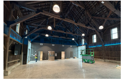
Interior of new event center