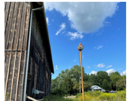
Alternate view of acoustic site 2, mini bat & SM4, 8.30.22