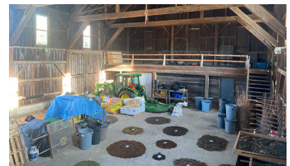
Existing barn interior used for seed drying

While there is extensive research on ways to exclude bats, far fewer studies examine how to accommodate them while maintaining safe human occupancy. Shaker Trace now serves as that case study.