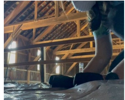
Biologist collecting fresh guano samples for lab analysis

During the project planning process, the team collaborated to research best practices. An environmental consultant, S&ME, was engaged to assess existing bat species through a series of auditory surveys (through EnviroScience, Inc.), and guano testing (through the Northern Arizona University's Bat Ecology & Genetics Lab). The findings determined that only Eptesicus fuscus - also known as Big Brown Bats - inhabited the barn, with a minor subset of other species likely foraging nearby. Although Big Brown Bats are not currently listed as threatened, endangered, nor on watch lists, Great Parks leaned into their mission as forward-looking leaders in conservation, and challenged the project team to explore design solutions that integrated bat habitat as part of the design.